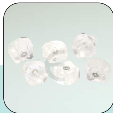
Magnetic guided disc (Set of 12) Part no - 0201A00007