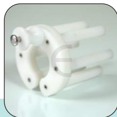
Disc handling device Part no - 0201A00018