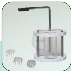
Three tube bolus basket assembly with guided disc (Set of 2) for EDI-2 Part no - 0202A00010